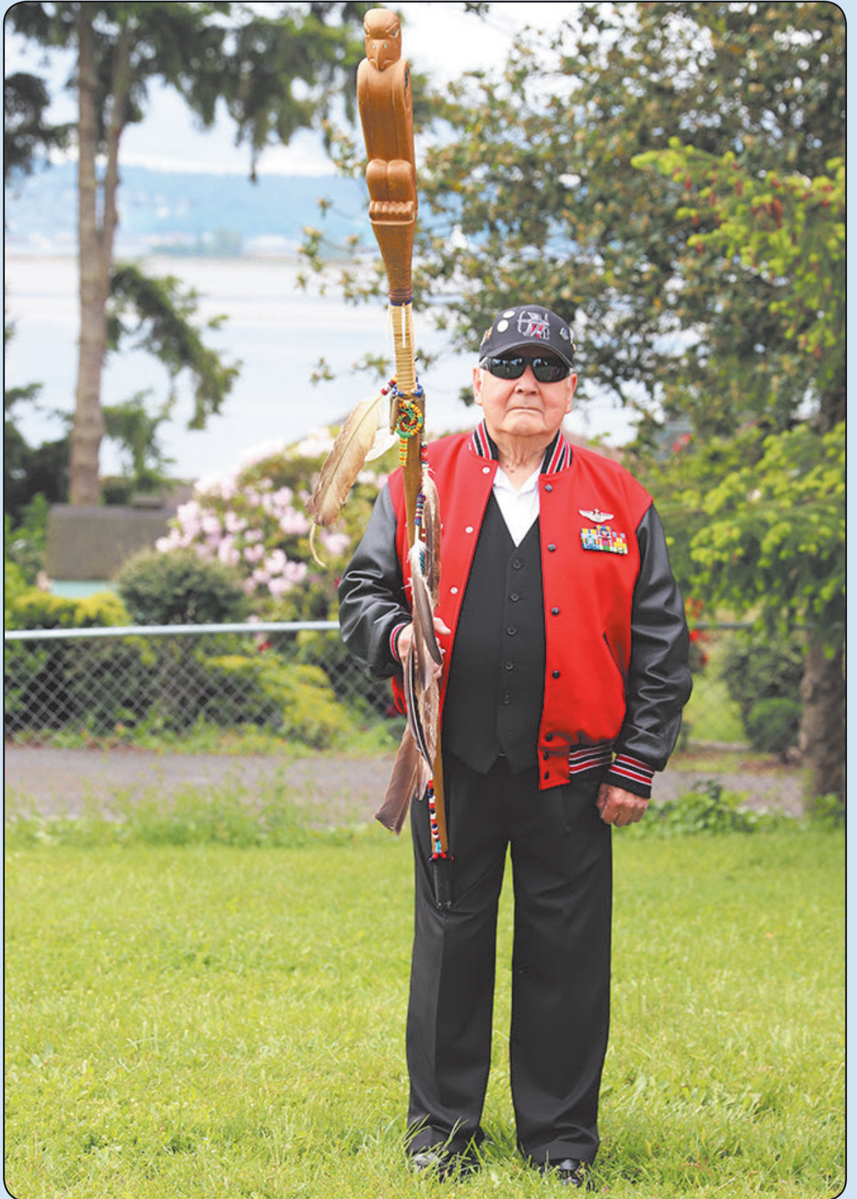
See Memorial Day, page 3

PRSR STD US Postage PAID Sound Publishing 98204