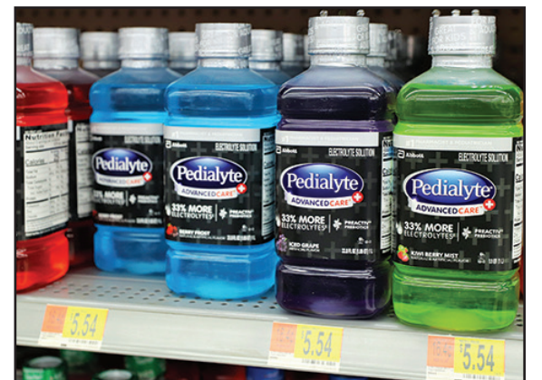
Products that the “Doe” family relied upon during their illness. Prices reflect availability at Tulalip Walmart