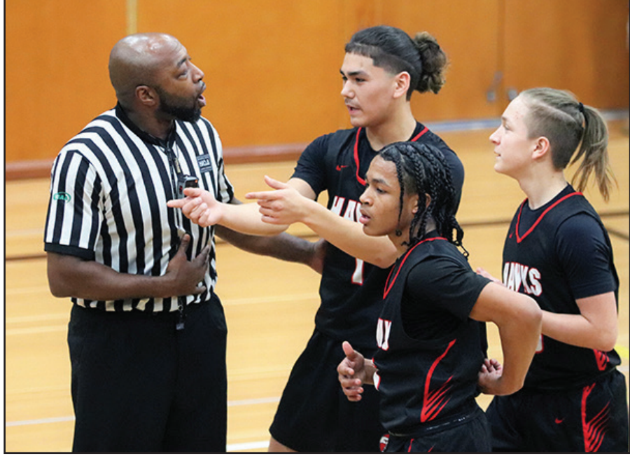
Hawks players explaining the subtle complexities of Rez ball to an open-minded referee.